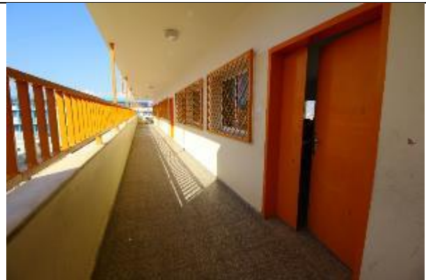
Salah El Deen School – After Rehabilitation