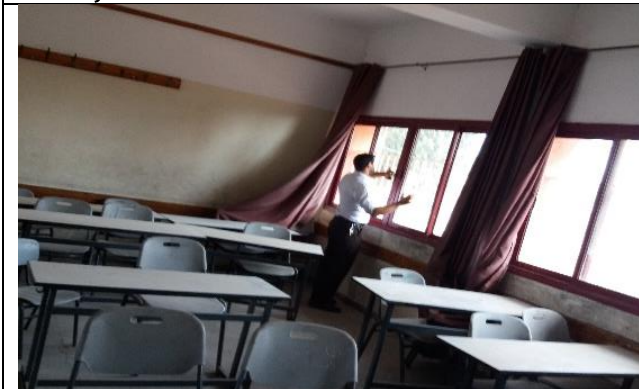
Beit Dajan School in Gaza - Before