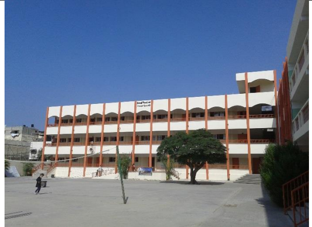
Al-Huda School – After Rehabilitation