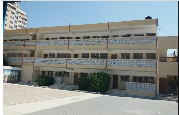
Mustafa Al-Rafei School for the Deaf – After