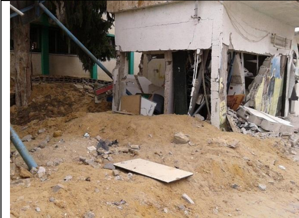
Canteen of Al-Abbas School – before rehabilitation