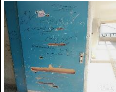
Salah El Deen School – Before Rehabilitation