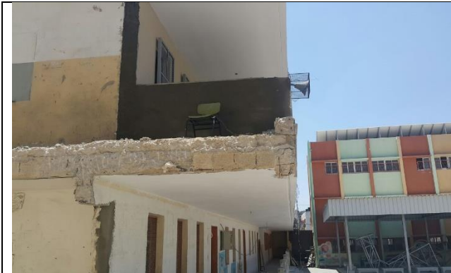
Al Shujaia School - Before