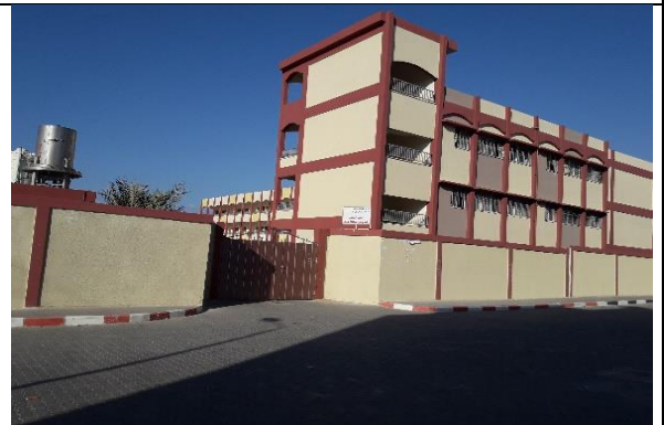
Ahmed Yasin School – After