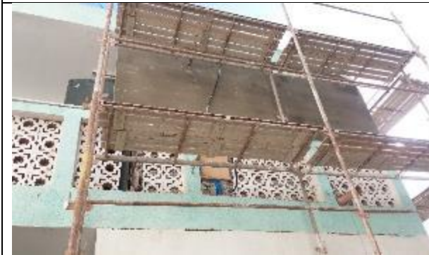
Salah El Deen School – Before Rehabilitation