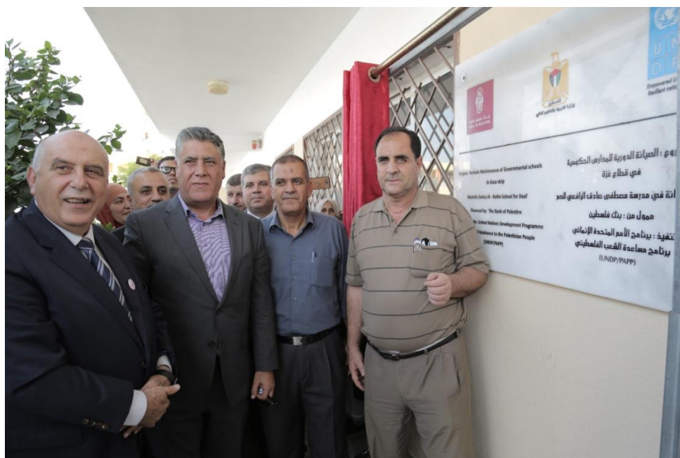
Opening Ceremony of Mustafa Sadeq Al-Rafei School for the Deaf in Gaza