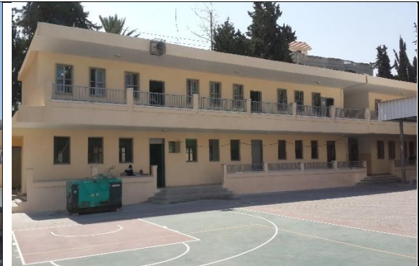
Al Shujaia School – After