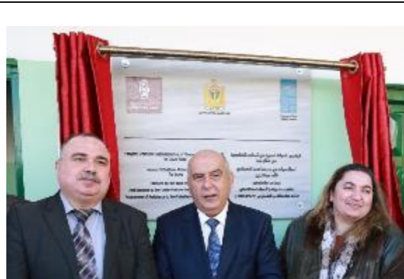
Al Saftawi School – After Rehabilitation