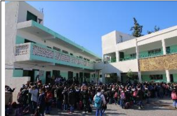
Al Saftawi School – After Rehabilitation