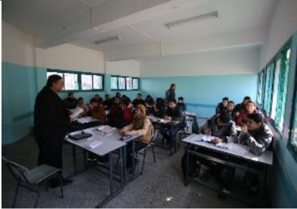
Al-Zaitoon School – After Rehabilitation