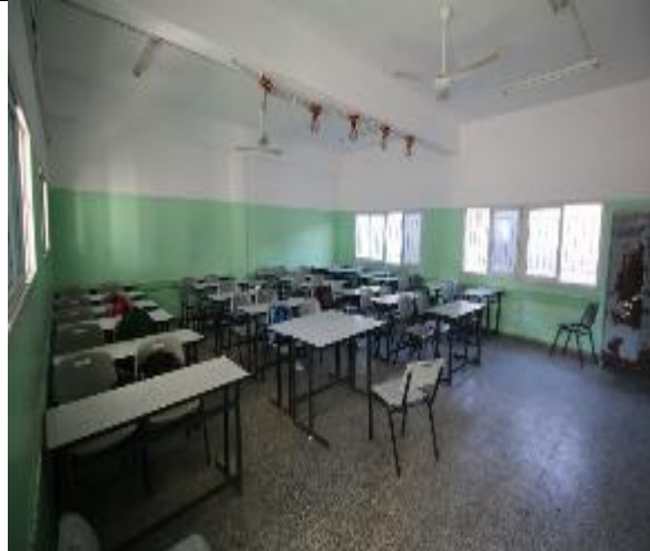
Al-Saftawi School – After Rehabilitation