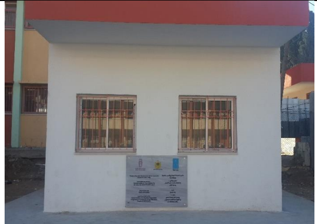
Canteen of Al-Abbas School – After rehabilitation