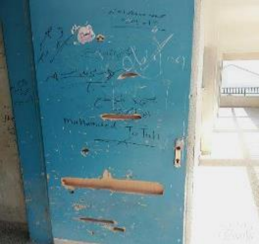
Al-Saftawi School – Before Rehabilitation