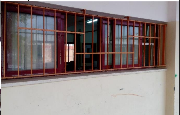
Beit Dajan School in Gaza - Before