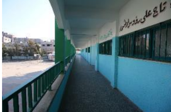
Al-Zaitoon School – After Rehabilitation