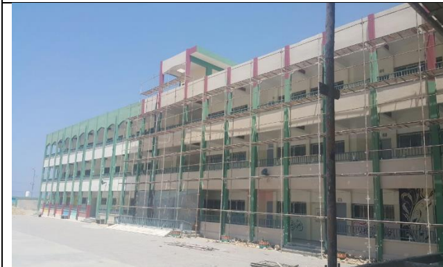
Ahmed Yasin School – before