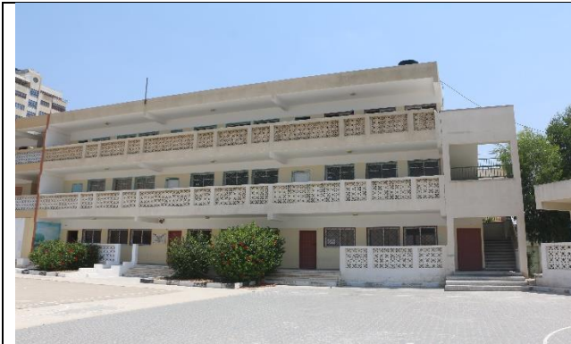
Mustafa Al-Rafei School for the Deaf – before