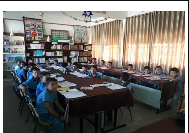
Omar Bin Al Khattab School – After