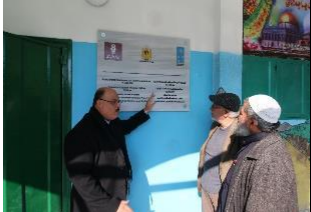
Al-Zaitoon School – After Rehabilitation