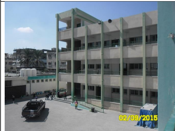
Hassan Al-Nakhal School - Before Rehabilitation