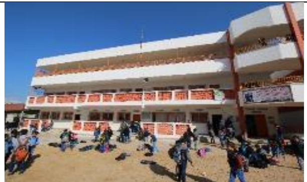
Salah El Deen School – After Rehabilitation