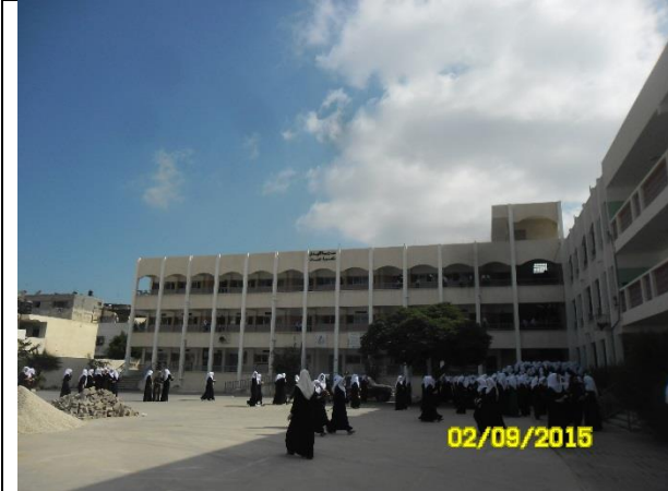
Al-Huda School – Before Rehabilitation

First Phase: Three Governmental Schools: