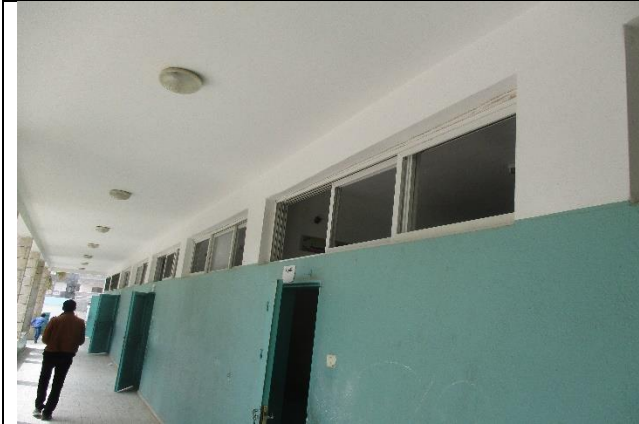
Omar Bin Al Khattab School – before