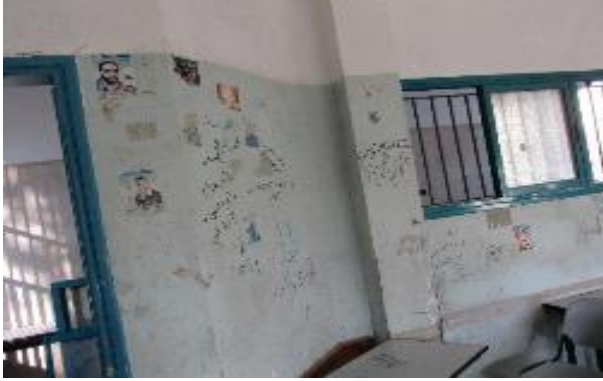
Al-Zaitoon School – Before Rehabilitation