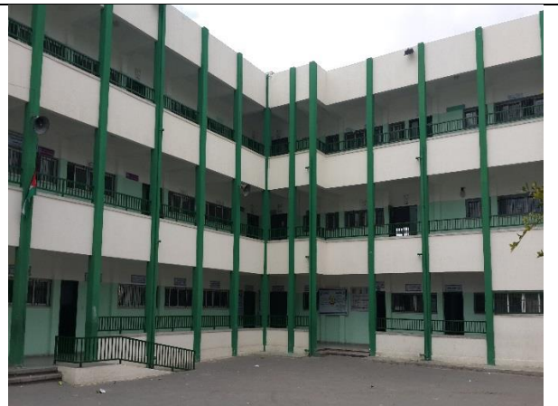
Hassan Al-Nakhal School - After Rehabilitation